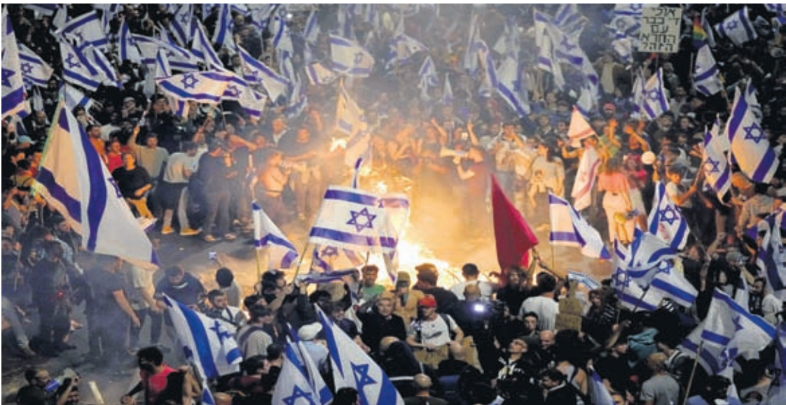
Israelis opposed to Prime Minister Benjamin Netanyahu's judicial overhaul plan set up bonfires and block a highway during a protest moments after the Israeli leader fired his defense minister, in Tel Aviv, Israel, Sunday, March 26, 2023. Defense Minister Yoav Gallant had called on Netanyahu to freeze the plan, citing deep divisions in the country and turmoil in the military.